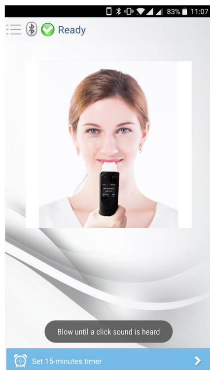
Photo taking during the test